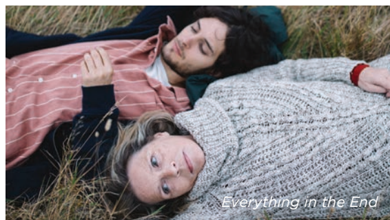
Everything in the End

A refugee's plans for a new life in the U.S. are threatened when he finds a dead body in his motel room.