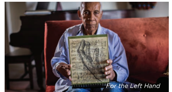
For the Left Hand